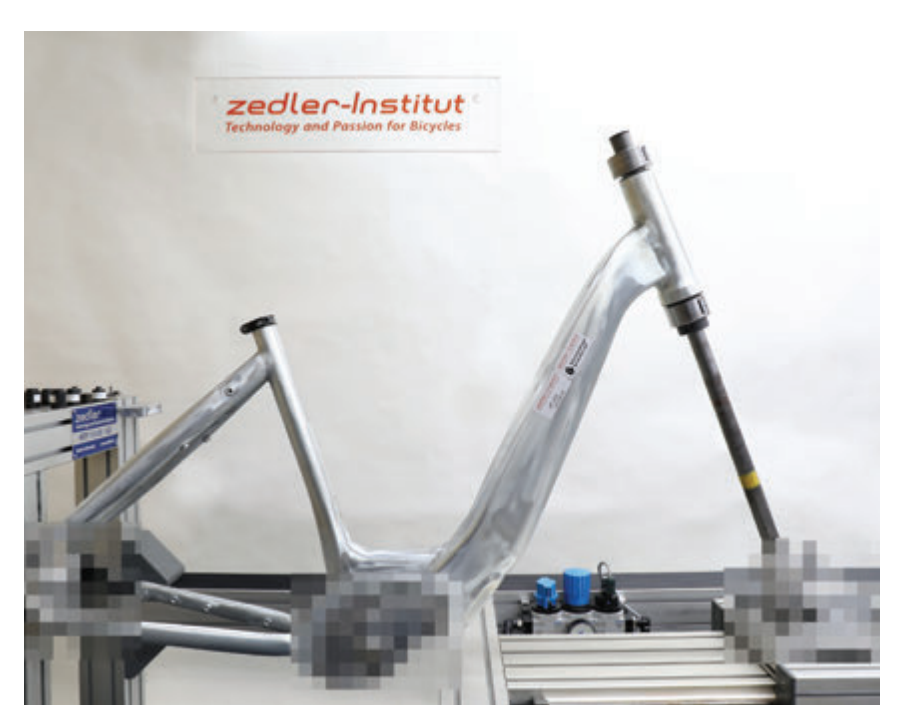
Even a step-through frames can be the foundation of a good XXL bike, as long as it is properly tested as shown here (identifying details are blurred).

Our tests, as well as real-world experience with XXL-tested products, confirm that bicycles are perfectly capable of carrying 180kg of total weight. But it's up to manufacturers to accept and promote these categories.